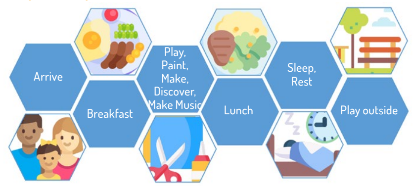
Figure 1: Simplified presentation of childcare options in Germany